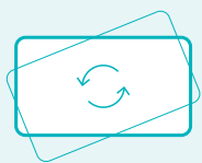
LEVELING ADJUSTMENT ( \pm 2^\circ )

SKU: 1IFESPT2355TVFLX EAN: 5600413203415